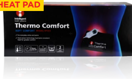
Thermo Comfort Heat Pad