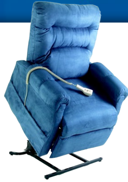
Pride C5 Lift Chair Single Motor (Available In Arctic Blue & Chocolate)