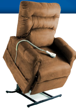
Pride C6 Lift Chair Dual Motor (Available In Arctic Blue & Chocolate)