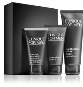
Clinique For Men Custom-Fit Daily Hydration GIFT SET