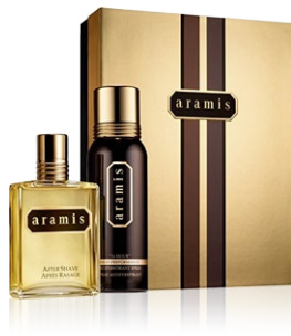
Aramis Aftershave 120ml & Aramis Deodorant 200ml GIFT SET