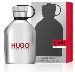
Hugo Boss Iced 75ml