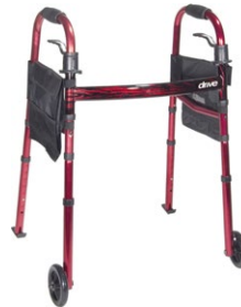
Deluxe Portable Folding Travel Walker (Available In Chocolate & Navy)