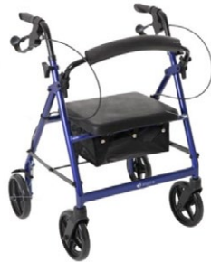
Aspire Classic Seat Walker 8 Inch Wheels (Available In Red & Blue)