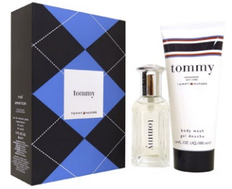
Tommy Boy American Edt 100ml & Aftershave 100ml GIFT SET