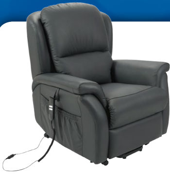
Stella Recliner Lift Chair Leather - Dual Motor (Available In Chocolate & Navy)