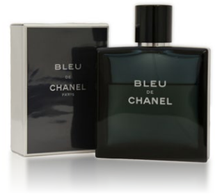
Chanel Bleu 50ml