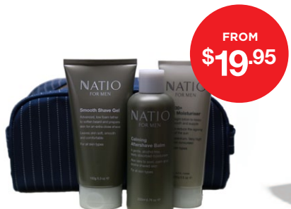
NATIO Men's Packs