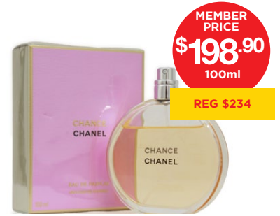
CHANEL Chance EDP 50ml $164 | M $139.40