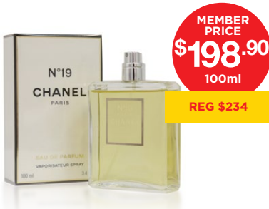
CHANEL No 19 EDP 50ml $164 | M $139.40