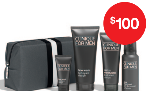
CLINIQUE Great Skin for Him