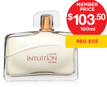
ESTEE LAUDER Intuition