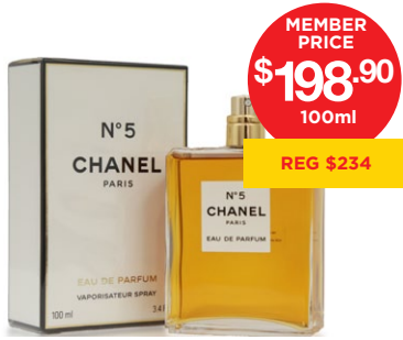
CHANEL No 5 EDP 50ml $164 | M $139.40