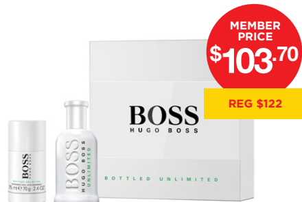
HUGO BOSS Bottled Unlimited