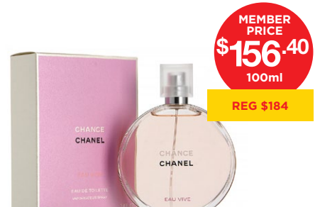
CHANEL Chance Eau Vive EDT 50ml - $130 | M $110.50