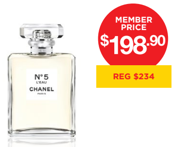
CHANEL No 5 L'EAU 50ml $164 | M $139.40