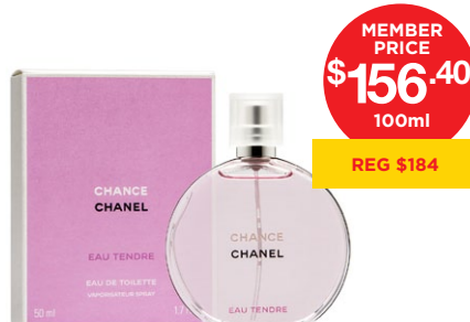
CHANEL Chance Eau Tendre EDT 50ml - $130 | M $110.50