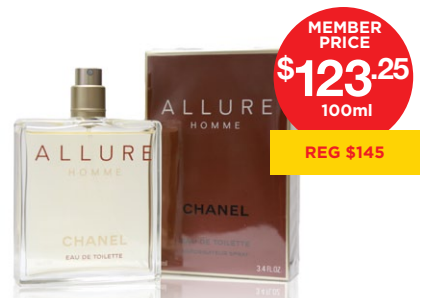
CHANEL Allure Homme EDT 50ml $102 | M $86.70