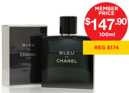
CHANEL Bleu de Chanel EDP 50ml $123 | M$104.55