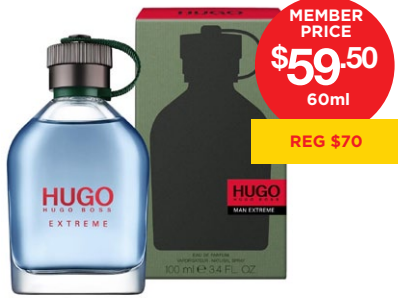
HUGO BOSS Extreme Men