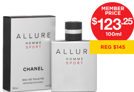
CHANEL Allure Homme Sport EDT 50ml $102 | M $86.70