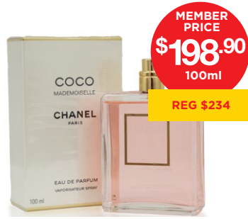
CHANEL Coco Mademoiselle EDP 50ml $164 | M $139.40