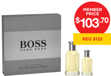
HUGO BOSS Bottled pack