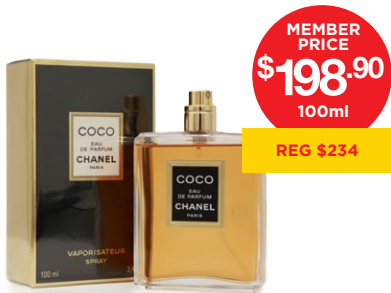
CHANEL Coco EDP 50ml $164 | M $139.40