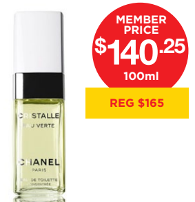
CHANEL Eau Verte Cristalle 50ml $130 | M $110.50