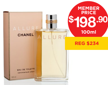
CHANEL Allure EDP 50ml $164 | M $139.40