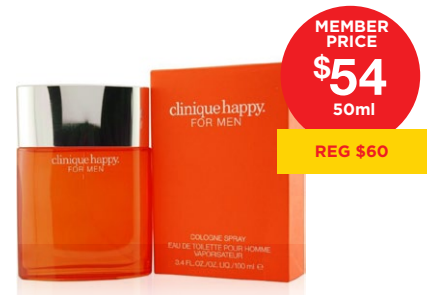
CLINIQUE Happy for Men