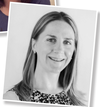
→ Clare Podiatrist

We're here for you. See a Local GP After Hours