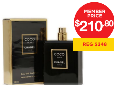
CHANEL Coco Noir 50ml $174 | M $147.90