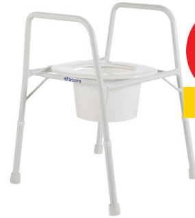
ASPIRE Toilet Surround