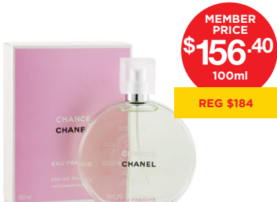
CHANEL Chance Eau Fraiche EDT 50ml - $130 | M $110.50