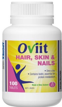
Oviit Hair, Skin & Nails 100 Tablets

Help fight redness ✓ fine lines ✓ wrinkles ✓ puffiness ✓