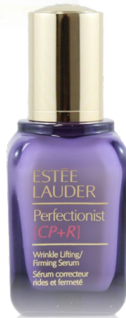
Estee Lauder Perfectionist [CP+R] Wrinkle Lifting /Firming Serum 50ml