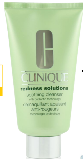
Clinique Redness Solutions Soothing Cleanser