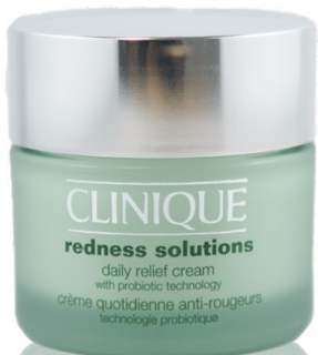
Clinique Redness Solutions Daily Relief Cream