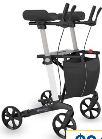
Walker Forearm Vogue