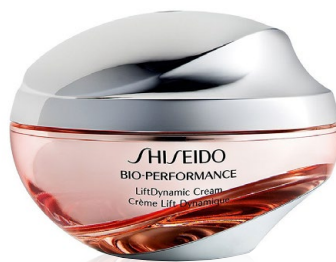
Shiseido Lift and Dynamic Serum