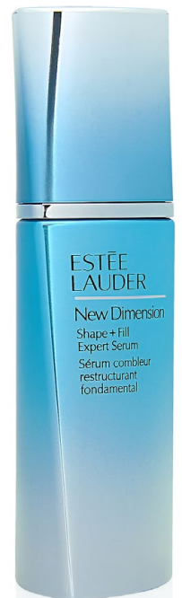
Estee Lauder New Dimension Serum 30ml